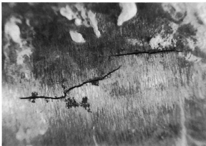
FIG. 2 Typical External Stress Corrosion Cracks (5× Magnification)